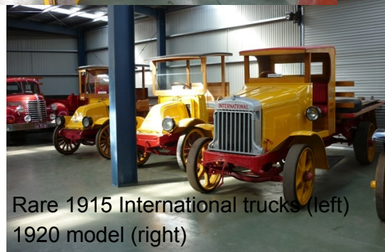
Rare 1915 International trucks (left) 1920 model (right)