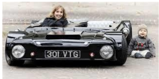
The world's lowest street-legal car is 19 inches