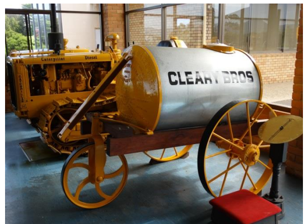
Furphy Water Tank