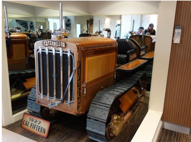
1927 CAT Fifteen