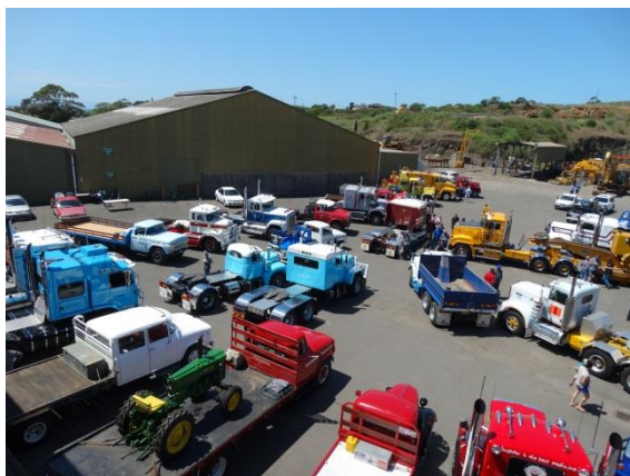
Some of the Outdoor Exhibits