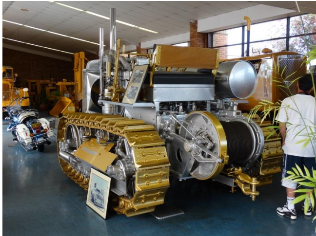
Silver and Gold Winch Crawler

On a beautiful sunny Sunday morning we met at the Wilton overpass to head down to Port Kembla for a visit to the Cleary Bros. Historic Equipment Museum of crawler tractors and trucks. We arrived a little early but this gave us time for a cuppa and to get some photos before the room filled with people.