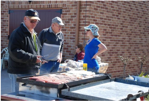
What would it be without the barbie!