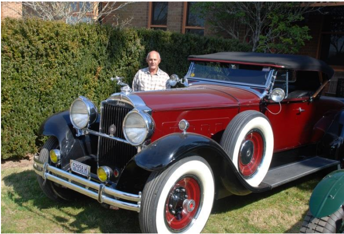
"Thou shalt not covet."