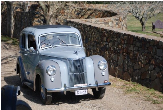
C'mon little fella, you can make it.