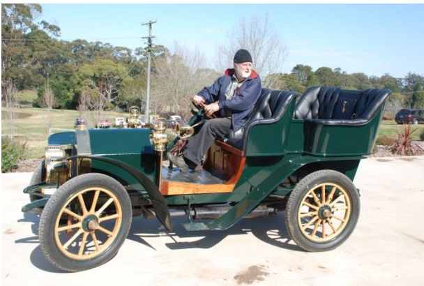
Always great to see the veterans