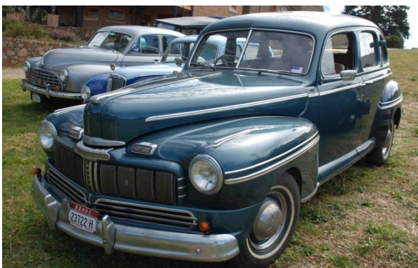
A beautiful classic