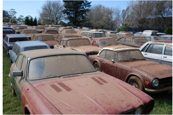
A couple of retirement jobs.