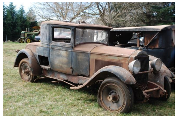
A work in progress