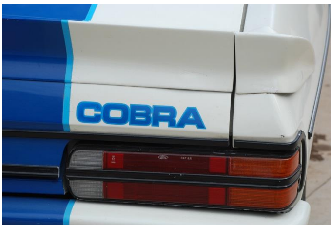
Hard to hate.