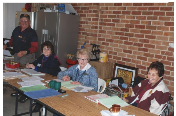
A big "thank you", ladies.