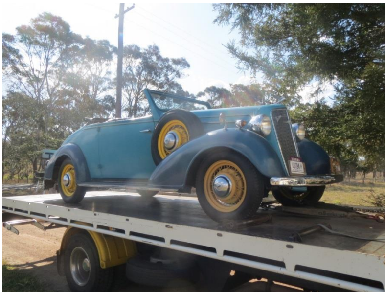
Let's be honest, would a Ford look that dignified in a difficult situation??